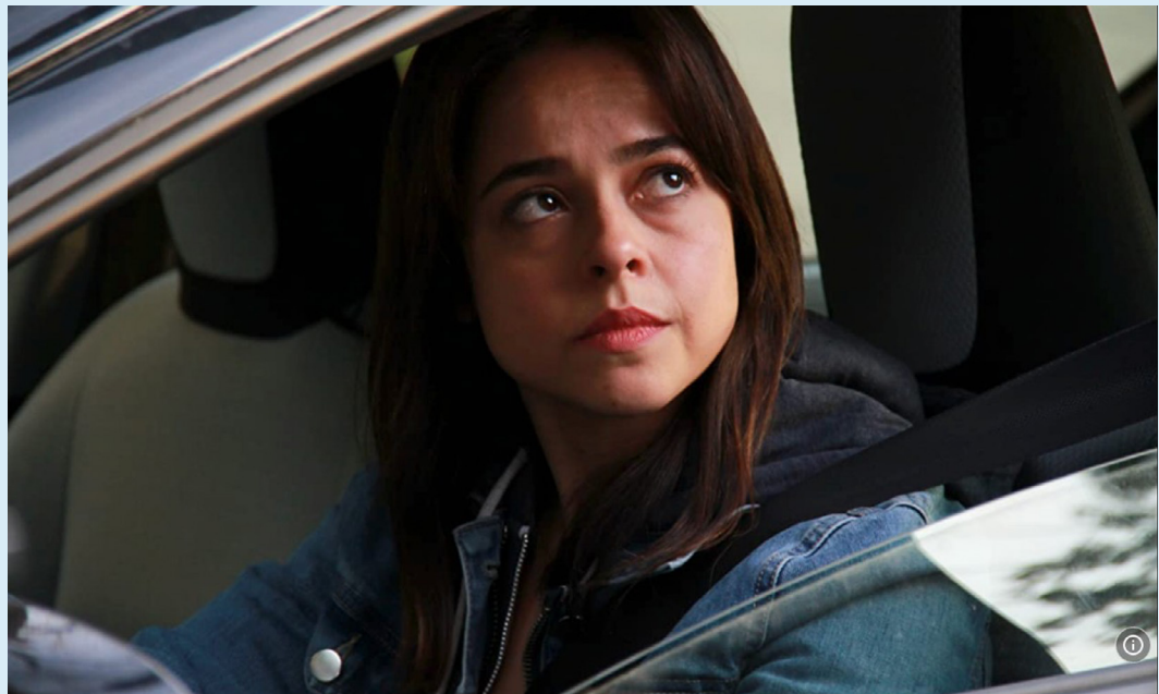
A film still from 'Marisol'