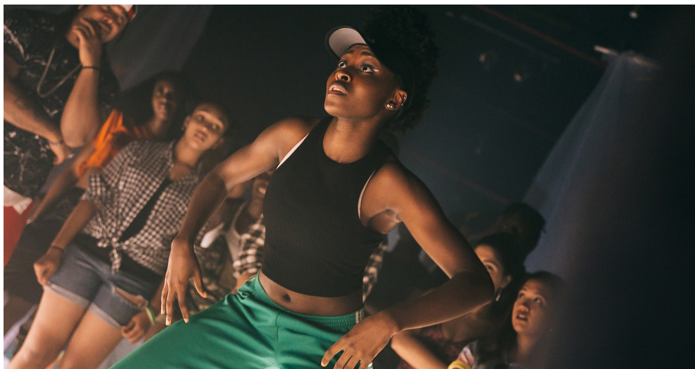
A film still from 'Farewell Amor'

At the Filmmakers Legal Clinic, we do not want these important stories to get lost in the quagmire of legal issues. Therefore, we aim to bring down the legal costs of filmmaking so that the door can be thrown wide open for many stories to make their way to the screen.