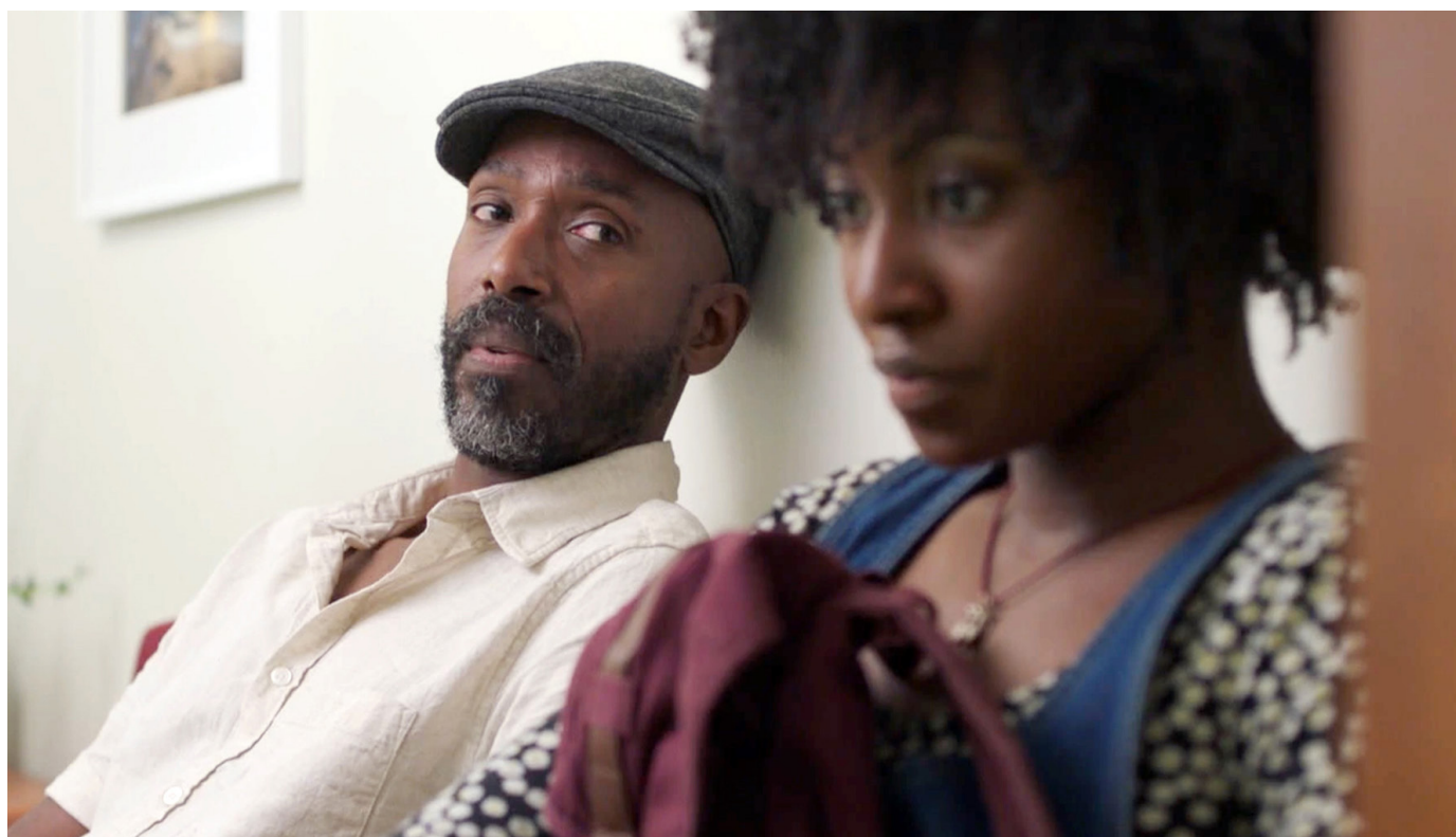
A film still from 'Farewell Amor'

We help filmmakers navigate contractual, legal, and business issues so that their important films can be made and distributed. To empower creators, the FLC provides individual client representation, educational services, “know your rights” trainings for community partners, and pop-up legal clinics.